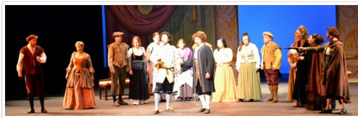
Don G. & his servant face the Seville mob

Unlike the 18 th century Venetian Giacomo Casanova ; DON JUAN is pure legend. But the Da Ponte/Mozart operatic drama gio coso- DON GIOVANNI is the real thing . Ranking in the genre's ten most popular; the validation is understandable: – crazy plot...incredible music!